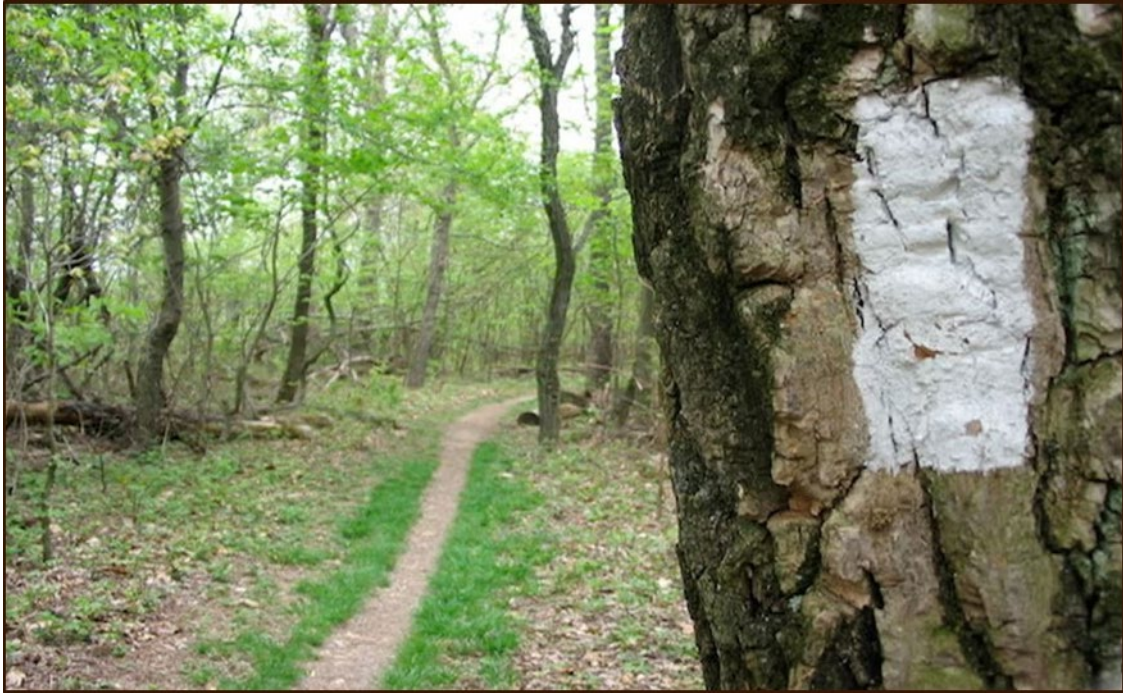
Blaze marking the path of the Appalachian Trail