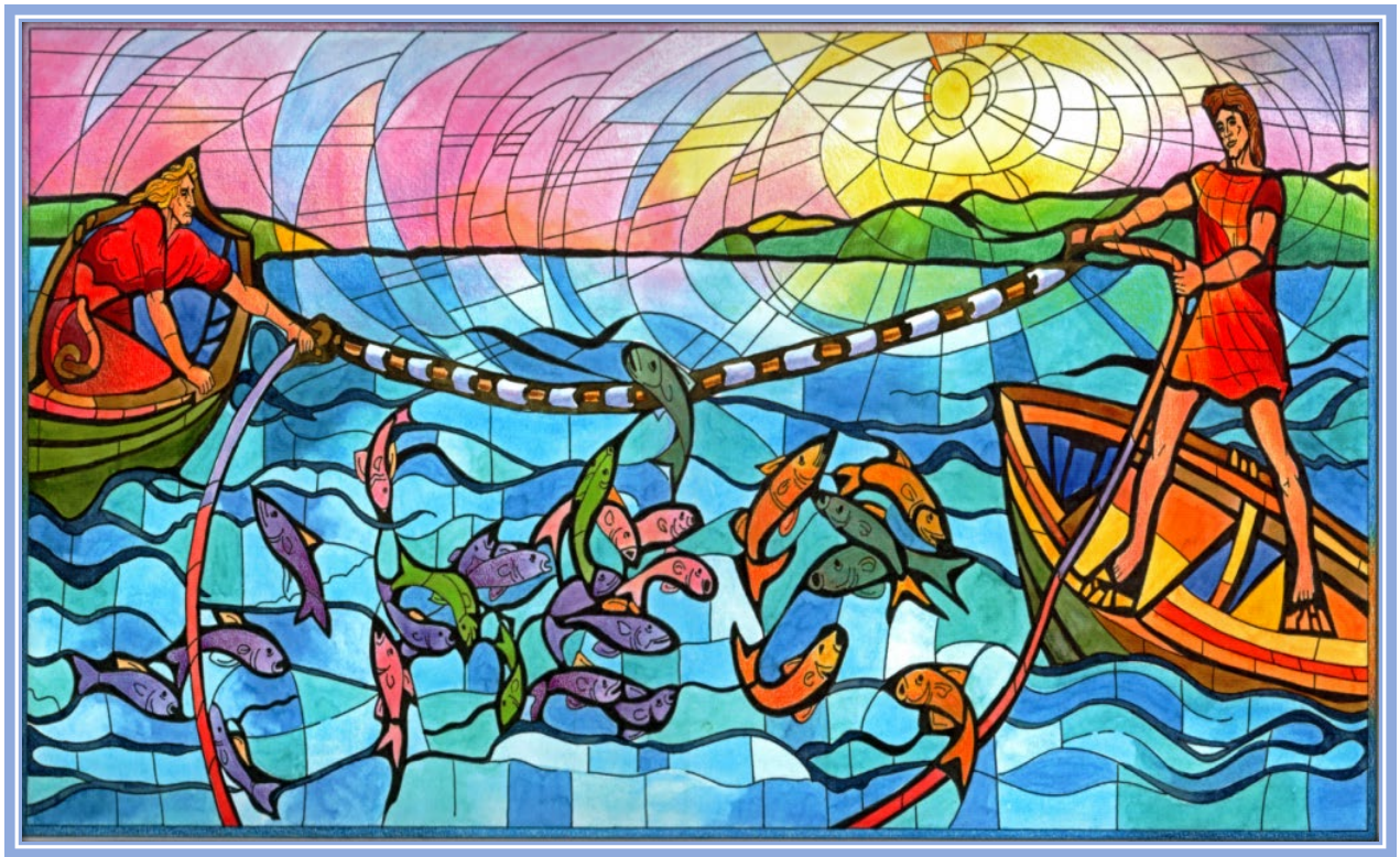
St. Andrew and St. Peter Fishing in the Sea of Galilee