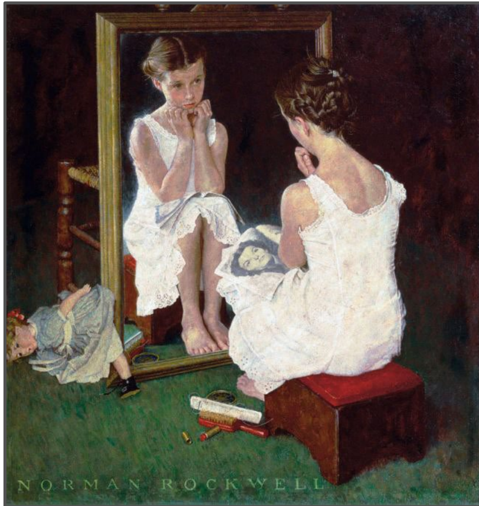
"Girl at Mirror" Norman Rockwell