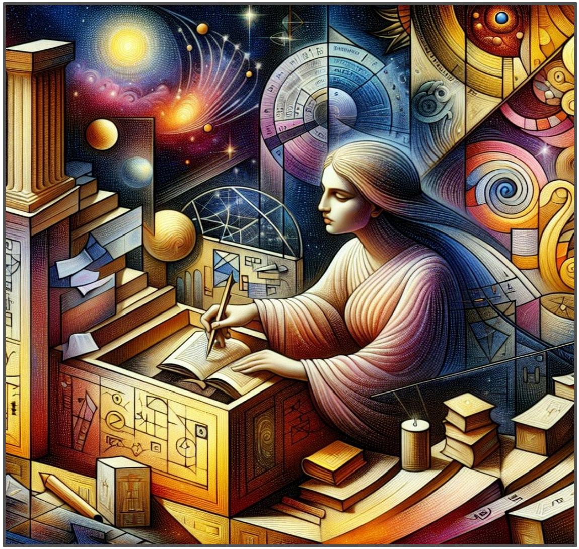
Proverbs 9:1. (n.d.). Bible Art.