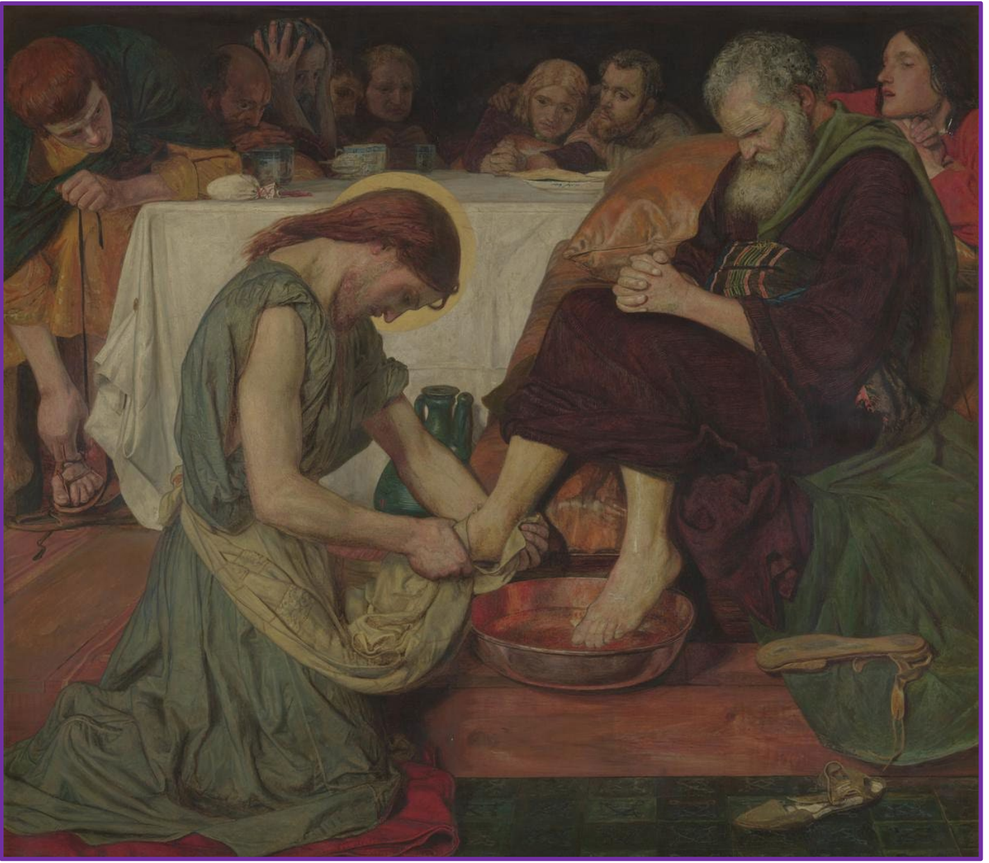
"Jesus Washing Peter's Feet" by Ford Madox Brown (1852)