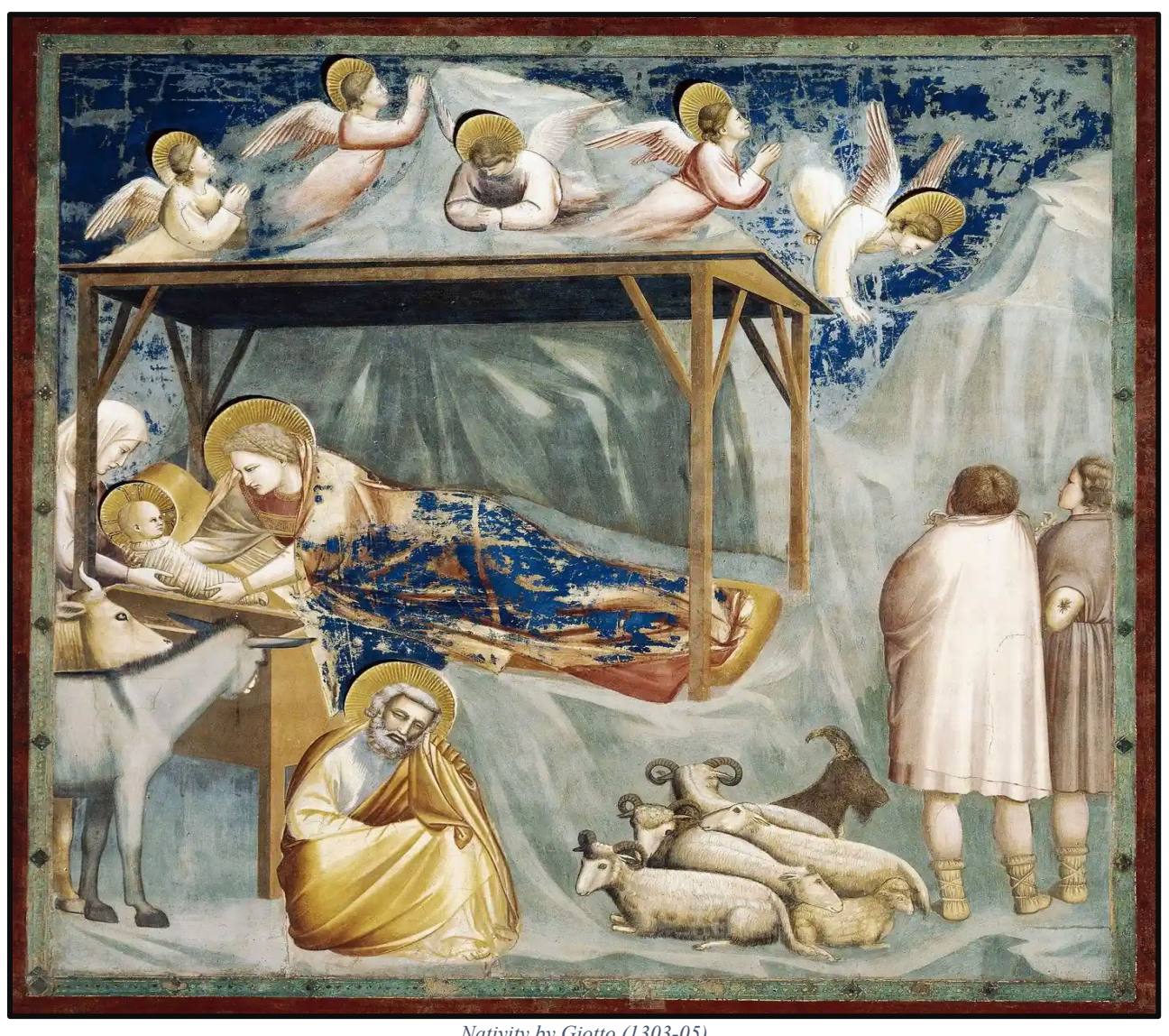
Nativity by Giotto (1303-05)