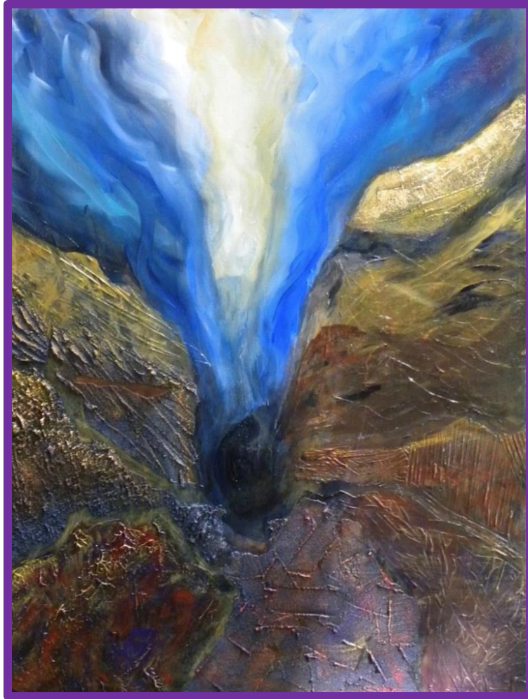
"Out of the Depths" by Lucy Adams